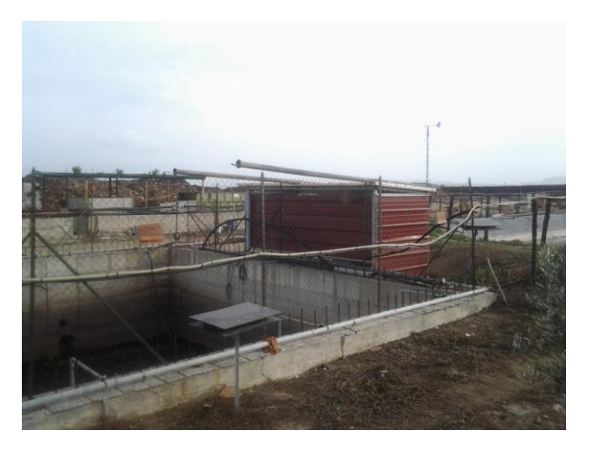
Small lagoon treatment