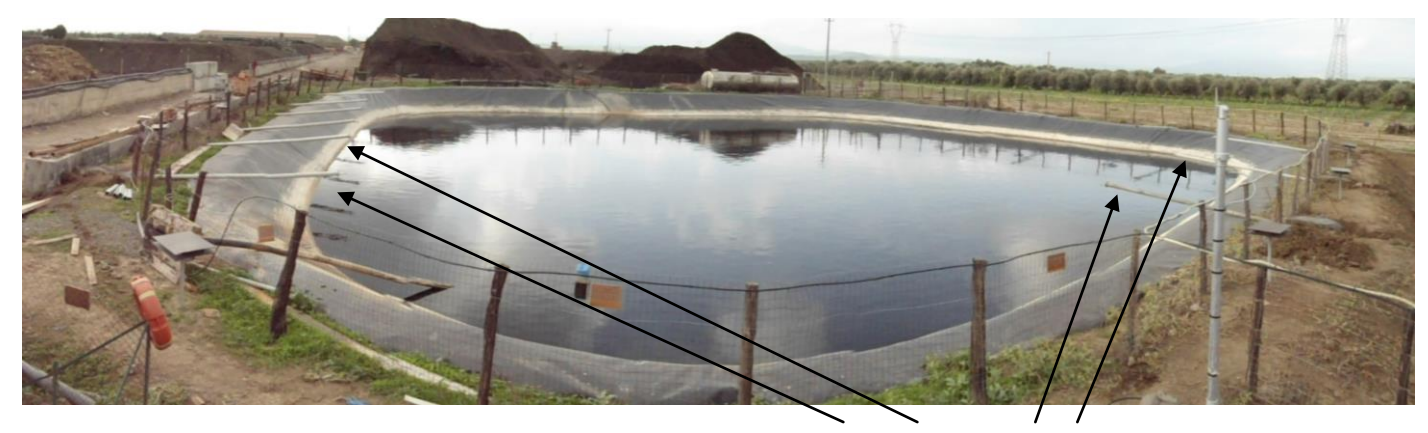
Big lagoon treatment – cans with nozzles